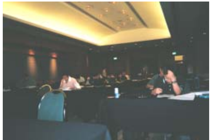
Sweating out the EMC examination

NARTE has been working with representatives from Nanyang Polytechnic University and Rhode and Schwarz to establish a NARTE EMC certification base in Singapore. The 17th International Zurich Symposium in Electromagnetic Compatibility and Exhibition on EMC & RF/Microwave Measurements and Instrumentation was held in Singapore February 27 to March 3, 2006. NARTE was invited to staff a complimentary booth and present a workshop on certification at the show. The week prior, Nanyang Polytechnic presented a refresher course on EMC. As a result, 21 people signed on for the examination. Of those, 17 actually made it to the examination. The examinations are on their way to NARTE to be scored.